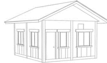
Secondary Dwelling Unit