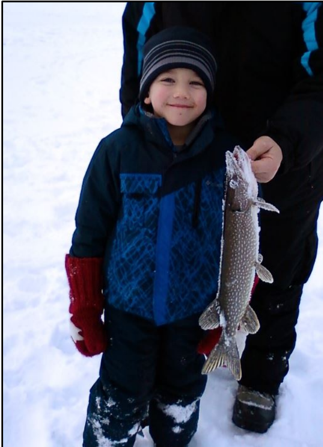
Figure 1: Young angler with a Northern Pike caught while ice fishing