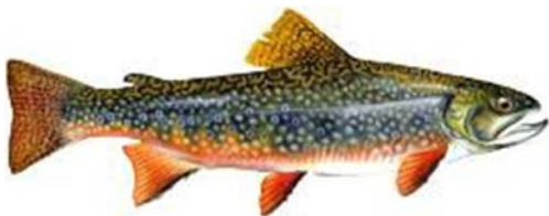
Figure 4: Brook Trout

The loss of natural and stocked Brook Trout lakes in FMZ 11 is thought to be significant. The inability to compete with introduced species and their dependence on up-welling, coldwater springs have made Brook Trout susceptible to decline.