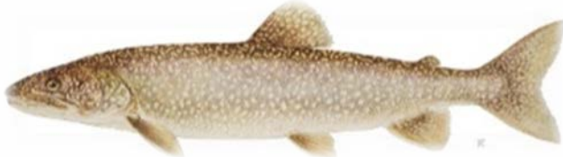
Figure 1: Lake Trout

The status of natural Lake Trout waters in FMZ 11 is of particular concern. Lake Trout populations are characterized as stressed with low abundance.