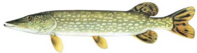
Figure 5: Northern Pike