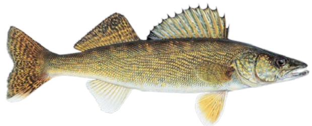
Figure 2: Walleye