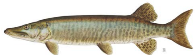
Figure 6: Muskie